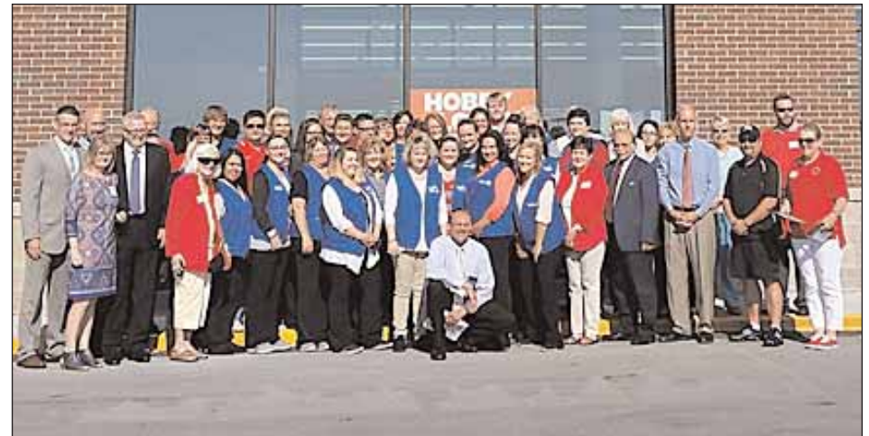
Hobby Lobby, business at 1131 N. Quincy Ave.