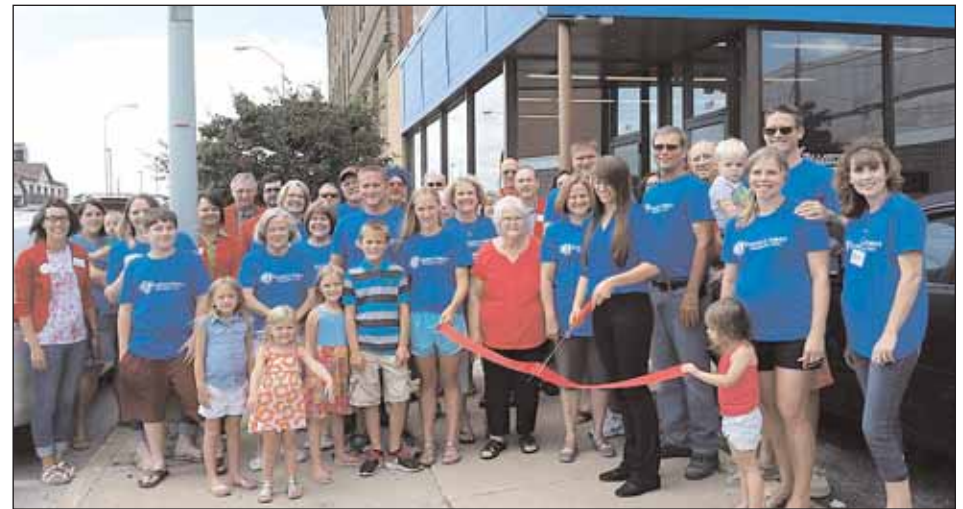
Family First Chiropractic Clinic PLLC, new business at 119 W. Second St.